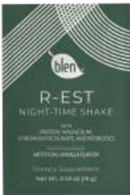
Night-Time Shake Net Wt. R-EST 0.53 oz (15 g)