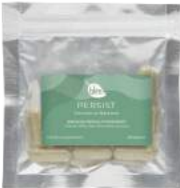
Capsules | 28 capsules