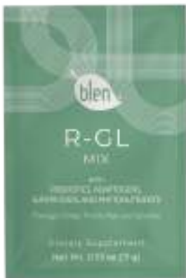
Mix Net Wt. R-GL 0.53 oz (15 g)