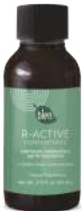
Concentrate Net Wt. R-ACTIVE 2.02 fl. oz (60 mL)