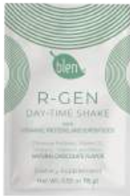
Day-Time Shake | Net Wt. R-GEN 0.53 oz (15 g)