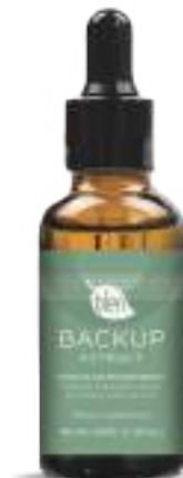
Extract Net Wt. BACKUP 0.68 fl. oz. (20 mL)

† This is a introductory price available for a limited time. Blen USA reserves the right to change this price at any time and under any conditions it deems appropriate.